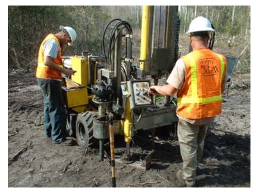
WPC CPT rig and operators