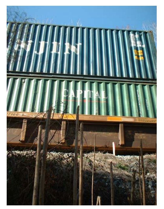
View of containers on existing track

Please visit www.geo-sys.com for electronic copies of this and other project descriptions.