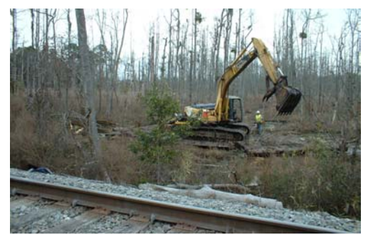
View of work from existing track

After compiling our field data, it was agreed that additional testing within the wetland area was needed. Our supplementary investigation consisted of cone penetration testing (CPT) performed by a WPC rig and operators working from timber soil mats supported on felled wetland vegetation. GeoSystems developed plans to move the timber mat platform into the wetlands with a contract excavator and chains. The mats were hoisted by the excavator and lifted over the CPT rig to advance the working crew. Operating the compact CPT rig and excavator on the same mats was difficult but necessary as the soft surface was not sufficient to support any machinery without extensive modification. Data recorded from the cone penetration tests showed very soft to soft soils to depths of twenty feet in the central portion of the wetlands.