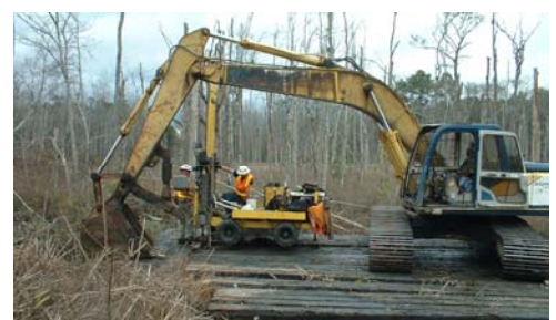
CPT working from timber platform